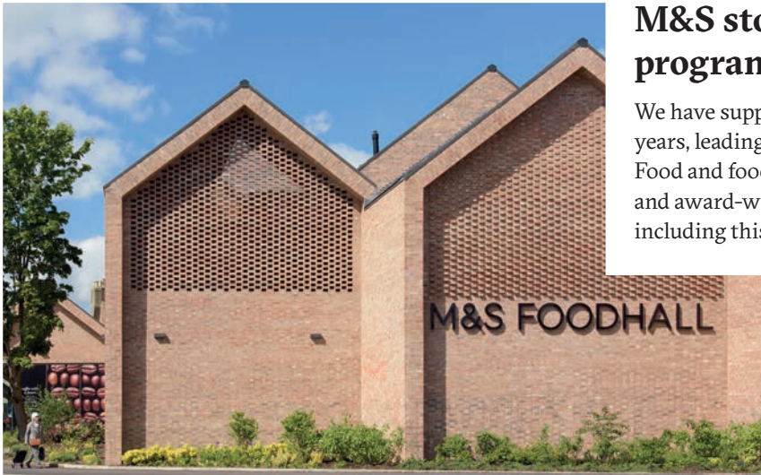
© Jill Tate - M&S Foodhall, Northallerton, Yorkshire