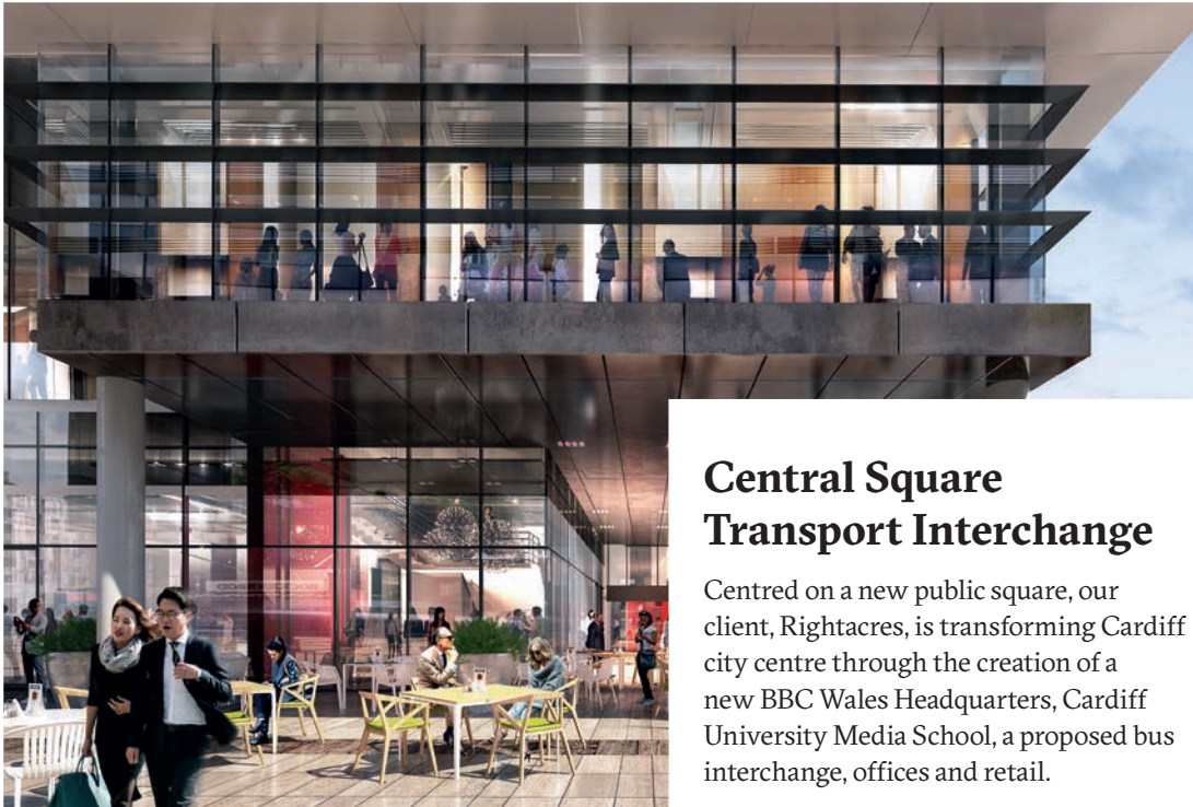
© Foster + Partners courtesy of Rightacres